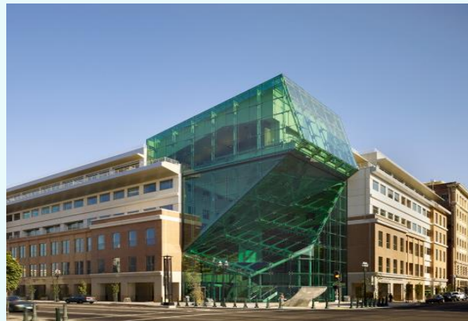
San Joaquin County Human Resources

The Big Rulebook that applies to everyone from the Sheriff's Office to the Hospital and other county departments.