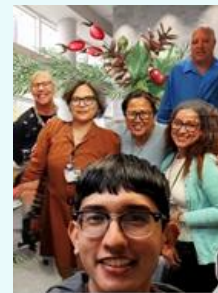
SJGH Human Resources Team